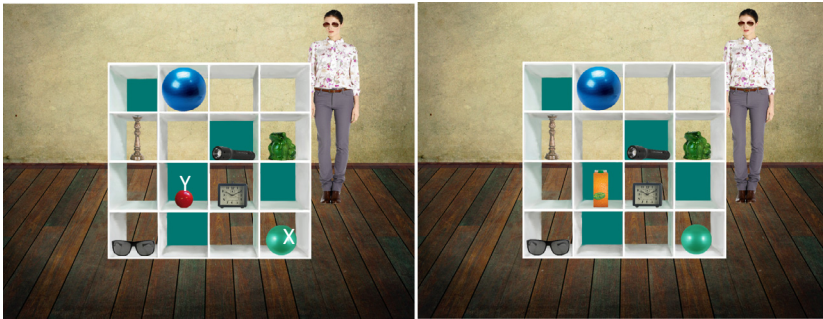
Fig. 1. Left: Example stimulus from an experimental trial. Right: Example stimulus from a control trial.

criterion because children who understood instructions they were given up to this point should be able to respond correctly. The 11 8-year-olds and 1 10-year-old who failed to answer this question correctly were still invited to carry on to a test phase, but their data were excluded prior to the analysis.